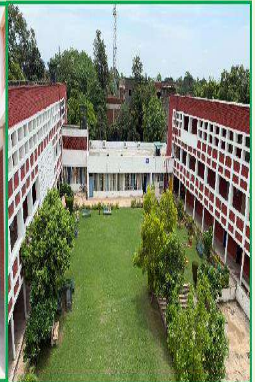
NEW HOSTEL (GIRLS)